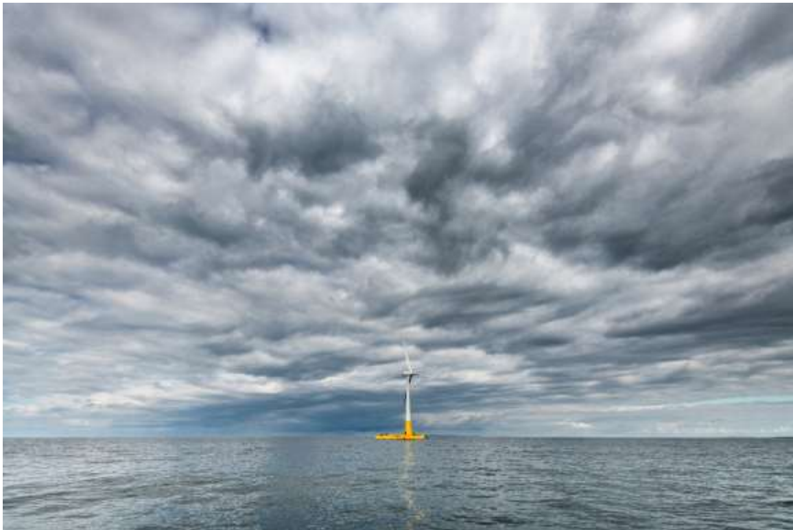
Figure 3. Floatgen Demonstrator, France

FOW cost reduction needs targeted R&I in mooring solutions, electrical cables and grid connections. The installation and hook-up of the mooring system and the dynamic electrical cable is a crucial part of the installation process in FOW. Industry needs to reduce the cost of such key components as well as the related offshore operations. Designing the right electric infrastructure for FOW is equally challenging. The movements of the turbine and the floating substructure increase the load on the dynamic section of the cables. Monitoring the aging of these components under cycling loads and marine growth can significantly contribute to cost reduction through lifecycle management. In waters deeper than 100m it is difficult to fix the array cables to the seabed. Different solutions of Electrical substation (fixed, floating, underwater) need to be investigated. Industry needs more R&I to find solutions to overcome these challenges, such as Joint Programming Initiatives dedicated to FOW.