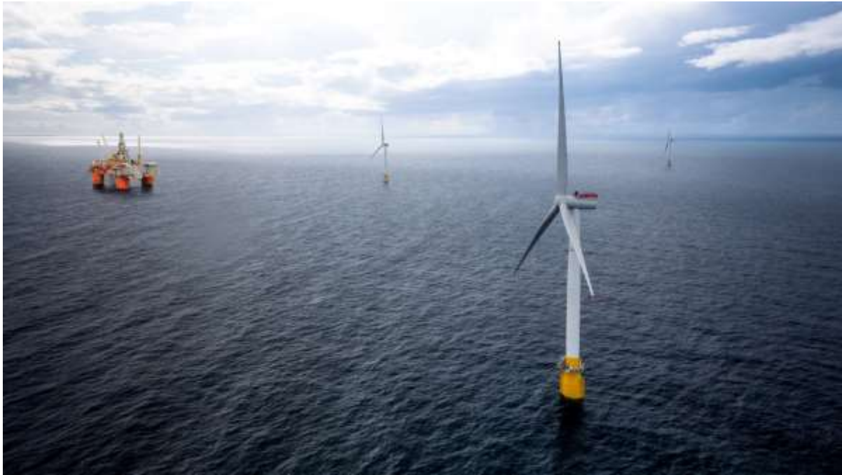
Figure 2. Hywind Project in Scotland

FOW is a natural complement to bottom fixed offshore wind. There are many synergies between the two technologies, notably regarding turbine design, structures and construction. Realising the potential of FOW will generate more economic opportunities for the entire wind energy supply chain, and in turn create new jobs. Europe is the undisputed leader in bottom fixed offshore wind. FOW is the logical long-term future of Europe's offshore wind energy.